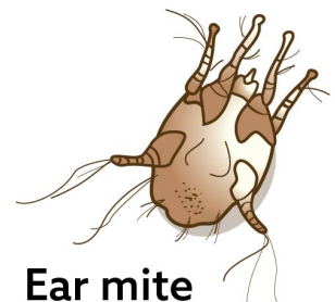
Ear mite Latin name: Otodectes cynotis

Your veterinarian will examine the ear canal with an otoscope that magnifies the tiny mites, or will take a small sample of the black debris and examine it under a microscope. Although the mites may crawl out of the ear canals for short periods, they spend the majority of their lives within the protection of the ear canal.